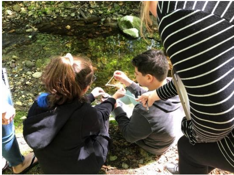
Mohawk Trail Regional School Students

We issued one school mini-grant last year and approved another one this fall. We will continue to offer additional small grants (up to $250 each) for school projects related to watershed studies and awareness. Public school teachers and students within the Deerfield River watershed are eligible to apply. Contact us for more information