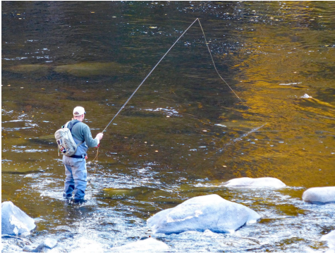
Fly-fishing the Deerfield River at Sunburn Beach.

The DRWA has been actively working for a safe, clean, and user-friendly river system with adequate public access . We have been advocating to our partners and local governments to create a River Recreation Plan that is now fully underway. A few positive changes to river safety, sanitation, and convenience were made in 2021 and 2022; with fingers crossed, more are on the way for 2023 and beyond. We even updated our River Recreation web page: Deerfieldriver.org/boating