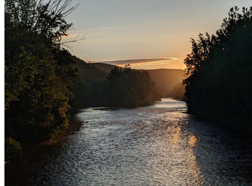
Sunset on the Deerfield River in Charlemont, MA.

After much effort, the DRWA's initiative to seek a National Wild and Scenic River study bill and eventual Wild and Scenic designation for select sections of the Deerfield River is now in the hands of our elected representatives in the US House and Senate. Congressman Jim McGovern (D-MA) and Senator Edward Markey (D-MA) introduced proposed legislation for a study bill to determine if segments of the Deerfield River and its tributaries could qualify for designation as part of the National Wild and Scenic River System. A copy of the proposed legislation is available for viewing at: deerfieldriver.org/wild-and-scenic