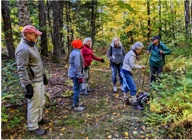
Guided hike in Shelburne.

This year we led four guided educational hikes, choosing the Town of Shelburne for our first series of hikes. Hikers enjoyed themselves and learned a lot. To keep up with any activity plans we might have in the future, be sure to follow us on