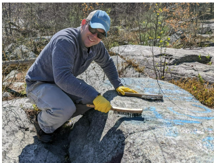
Removing graffiti at Gardner Falls.

Even though there are ten dams within the mainstem of the Deerfield River, most of the river looks incredibly natural. That is why it pains us when there is unnecessary defacement. In addition to the graffiti removed from river rocks near Wilcox Hollow in 2020, we discovered even more graffiti upstream of the Gardner Falls Hydroelectric Power Station. The Deerfield River Watershed Association (DRWA) tackled removal of this older graffiti in full force on April 30, 2022.