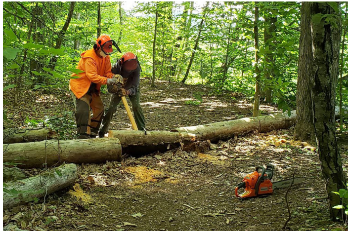
Volunteers clearing downed trees on the Mohican-Mohawk Trail.

As part of a large, collaborative effort, we worked with Franklin Regional Council of Governments and other partners to update the brochure and maps of the Mohican-Mohawk Trail System. The updated brochure and maps can be found at the Franklin Land Trust trailhead near the State Police barracks on Route 2 in Shelburne, or a PDF map can be accessed online at mass.gov/location-details/mohican-mohawk-trail